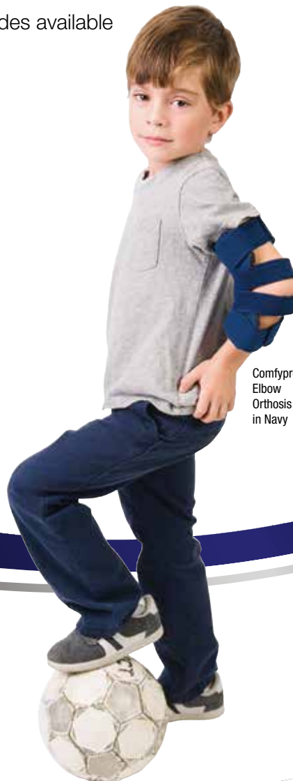
Comfyprene Elbow Orthosis in Navy