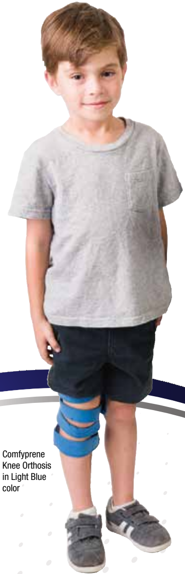
Comfyrene Knee Orthosis in Light Blue color

Goniometers allow for a set range of motion (ROM) or desired static set position in 5° increments. Spring Loaded Goniometer option has additional spring load that gently pushes extremity to selected degree of extension. (Can be special ordered to increase flexion.)