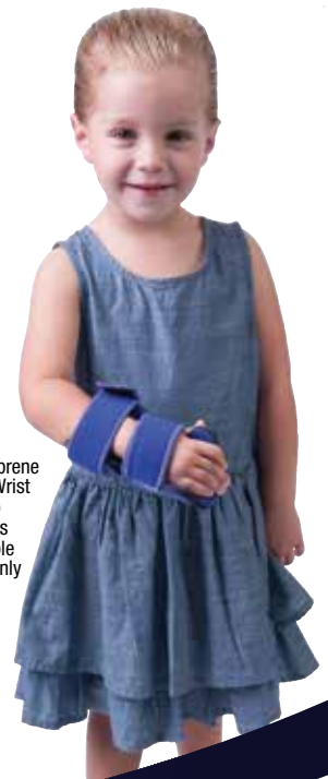
Comfyprene Hand Wrist Thumb orthosis in purple (with only 2 of 3 straps used)

Variety of Models to Meet All Splinting Needs