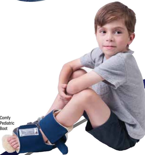
Comfy Pediatric Boot