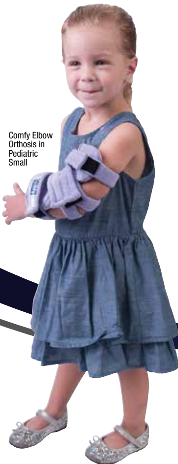
Comfy Elbow Orthosis in Pediatric Small