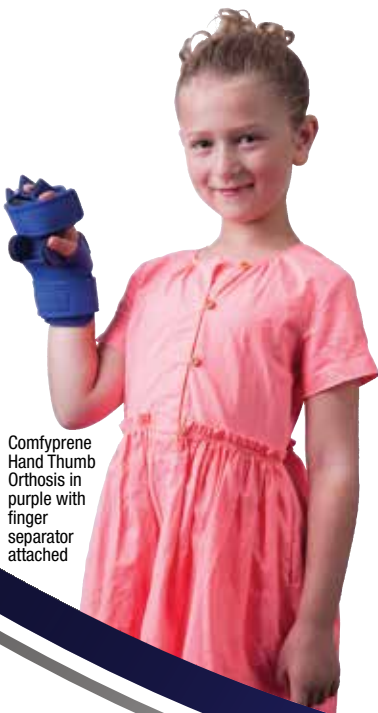
Comfyprene Hand Thumb Orthosis in purple with finger separator attached