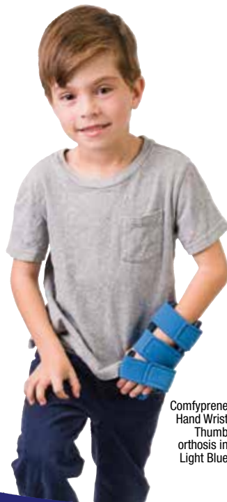
Comfyprene Hand Wrist Thumb orthosis in Light Blue